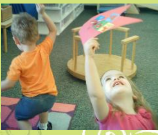
Left: Zavier works in the garden; Macie and Zavier dance with their red flags

Number two, the color blue and squares will be the September focus for our Two Year Olds.