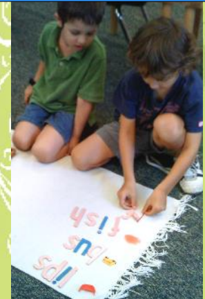
Vijay & Jesse busy working with the movable alphabet