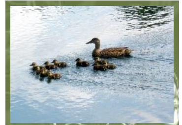
Mama Duck and her TEN little ducklings; one of the squirrel babies checking out the zucchini plant growing in the courtyard (left)