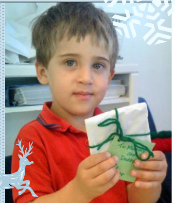
All wrapped up with a pretty card and ready to put under the tree!